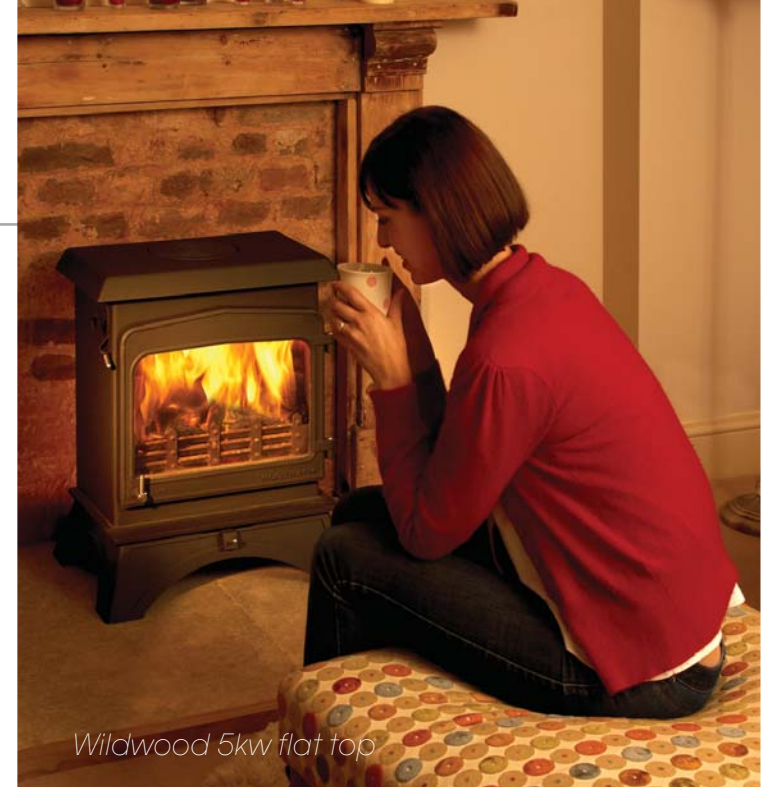
Wildwood 5kw flat top

A focal point to any room with all the air wash features of the Fireview range. Maintaining a bed of ash throughout the burning cycle, these stoves can be run for over three weeks without the need to remove the ash.