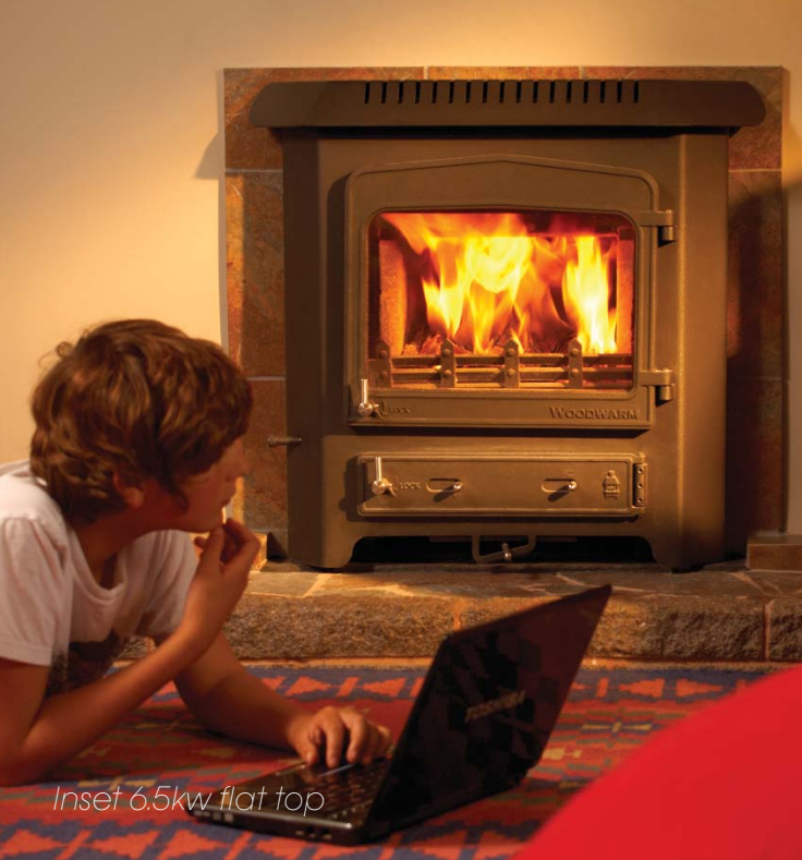
Inset 6.5kw flat top