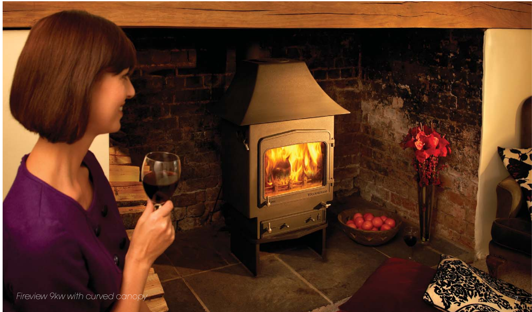
Fireview 9kw with curved canopy

Wood, fuel for the future. All fossil fuels emit carbon dioxide when they are burnt. This carbon dioxide increases the greenhouse gases in the atmosphere, which contribute to global climate change. It is therefore important to think about ways of reducing these emissions. Wood fuel is carbon neutral. It absorbs as much carbon in its growth as it releases as it's burnt. So now you can relax in more ways than one.