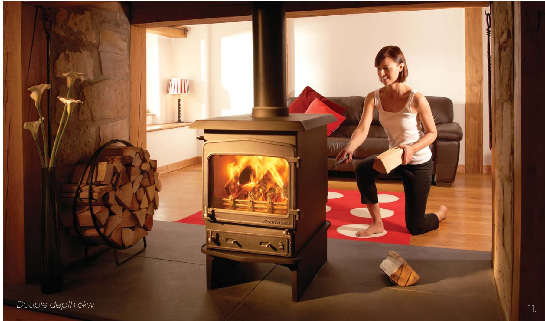
Double depth 6kw

Woodwarm stoves are constructed from high quality steel, cast iron and stainless steel fittings (brass fittings optional). All are individually built by craftsmen and carefully inspected to ensure consistent quality. Throughout product development procedures we pay great attention to detail, creating innovative and contemporary products. At Woodwarm we exhaustively test all manufacturing specifications and materials.