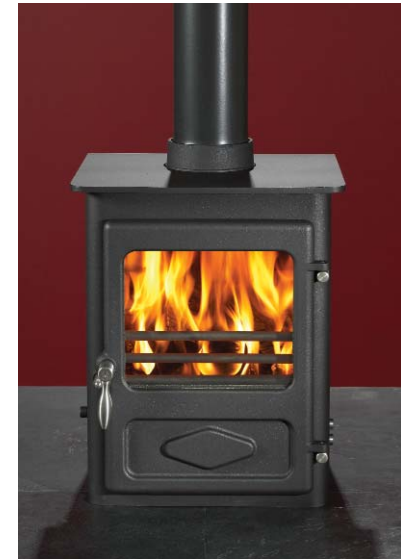
The Foxfire 4kw

The newest addition to our range. This little 4kw stove has stunning 82% efficiency! The Foxfire not only benefits from the unique Woodwarm clean burn air wash system, but also features new design details such as the stainless steel handle. It has the ability to have air ducted direct to it from outside. This feature, of room sealing a stove becomes an important consideration in new build eco homes. The rear heat shield is fitted as standard and there are options on 100mm or 150mm legs or a 200mm log store.