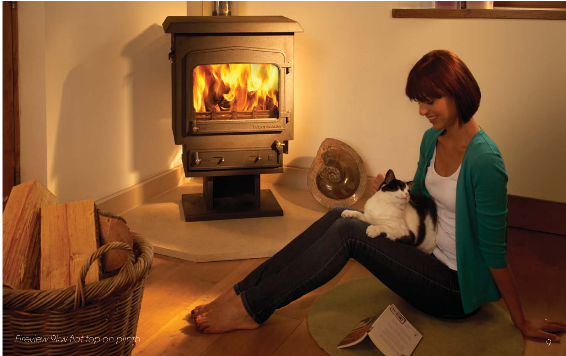
Fireview 9kw flat top on plinth

A wood burning stove has become a "must have" feature for stylish modern living. Woodwarm have found an environmental and efficient way of incorporating the romance of a traditional fire with modern family life.