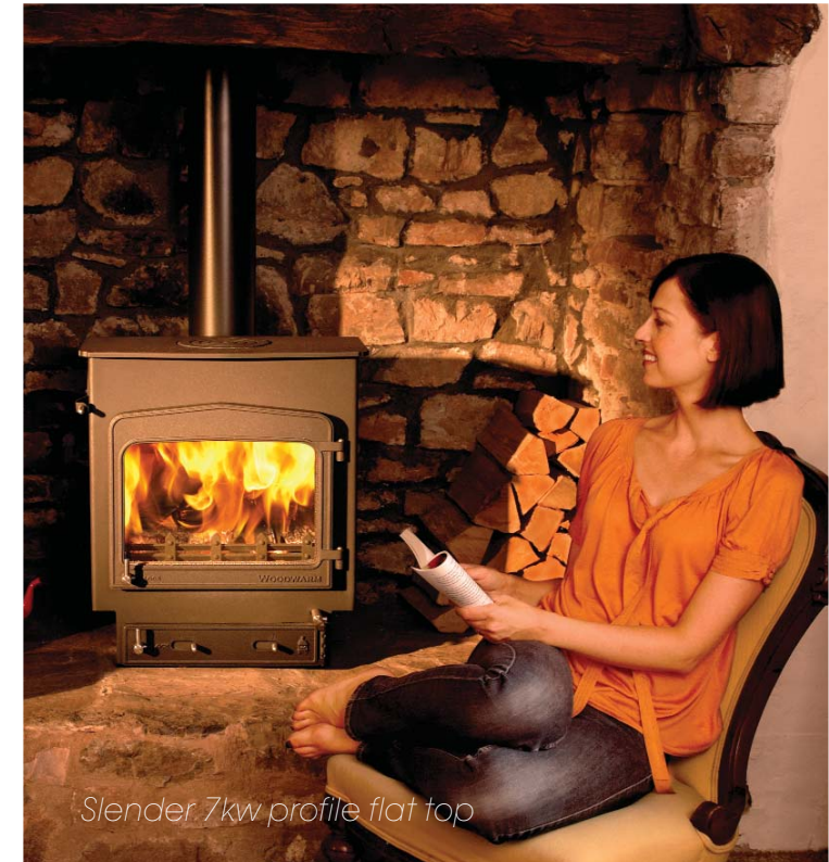
Slender 7kw profile flat top